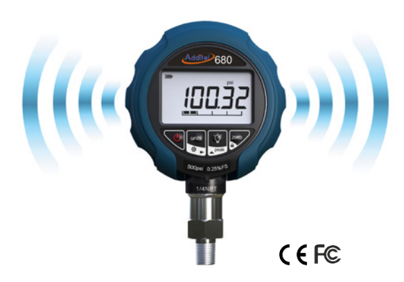
680 with data logging and wireless (optional)